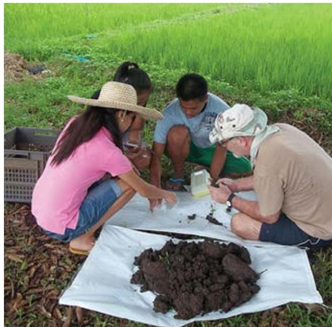
Figure 2. Handsorting earthworms in rice paddy at Kahariam (from Sterin et al. , 2014).

samples for evaluation of coefficients of variation, ten samples of 25 cm side to 20 cm depth (corresponding to the depth of mouldboard plough) were taken at monthly intervals for three months from each of the three sections (i.e., ~33 sample units per treatment). However, as Blakemore (2000) noted: “a sampling error of less than 10% of the mean cannot generally be obtained without excessive cost in sampling effort”. N-P-K data in (Blakemore, 2000) are not repeated here since they are less relevant with compost fertilizers where microbial activity governs mineralization in synchrony with plant demand (Balfour, 1977). No information was found on Balfour’s (1975) planned earthworm studies at Haughley, thus the only data is from Blakemore (1981; 2000). Earthworm extraction was by hand-sorting in all cases (Figure 2). Soil analyses used standard Walkley-Black method for total C, and/or loss-on-ignition for soil organic matter (SOM). Note that Walkley-Black often underestimates total C with a correction factor of ca. x 1.3 required.